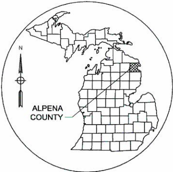
AREA MAP NOT TO SCALE